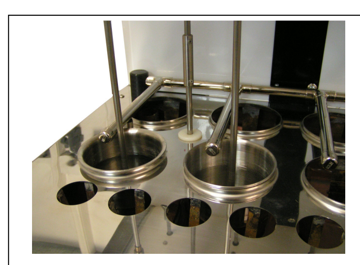
Details of jets for automatic distilled water refilling